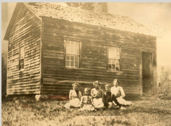
North Hollow School and class - circa 1920.