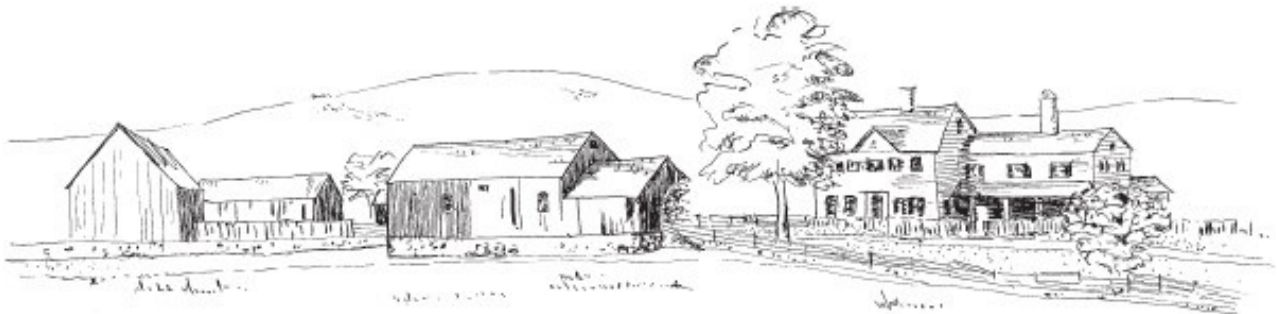
Illustration, L. Landgraf

NON-PROFIT ORG US POSTAGE PAID WINSTED, CT PERMIT No. 11