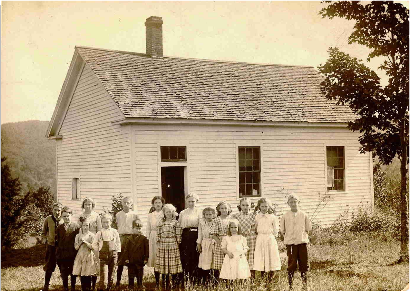
Photo above: Barkhamsted Center Schoolhouse and class - circa 1911.

The Barkhamsted Historical Society's one-room schoolhouse, the old Center School on Center Hill Road (Rt. 181) in Barkhamsted, will be open to the public on the following dates during the summer of 2023: